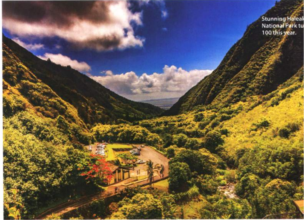
Stunning Haleakala National Park turns 100 this year.