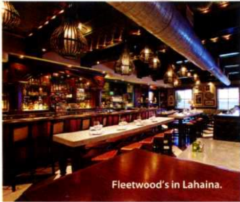
Fleetwood's in Lahaina.

For a casual breakfast, try The Gazebo at Napili Shores Maui by Outrigger. It's small and hidden, but Maui residents love it. You might have to wait in line, but the view and food are worth the wait.