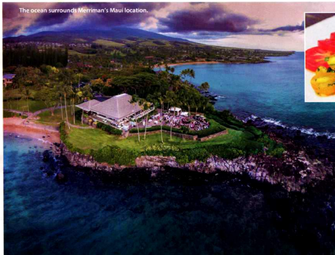
The ocean surrounds Merriman's Maui location.

At the top of my list is golf, which is spectacular on the island. I also enjoy hiking and exploring, as well as stand-up paddling, snorkeling and cliff jumping. Immersing myself in a great book while relaxing on the beach is another favorite activity and offers a tremendous break from everyday life. Nothing beats the stunning ocean views to really give you a true sense of place. The sunny northwest coast of Maui was once a retreat for Hawaiian royalty; today it's a wonderful place to explore, with resorts, shopping and restaurants.